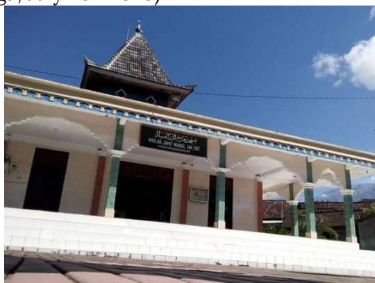
Figure 7. Exterior view of the Jami' Nurul Hayat Mosque