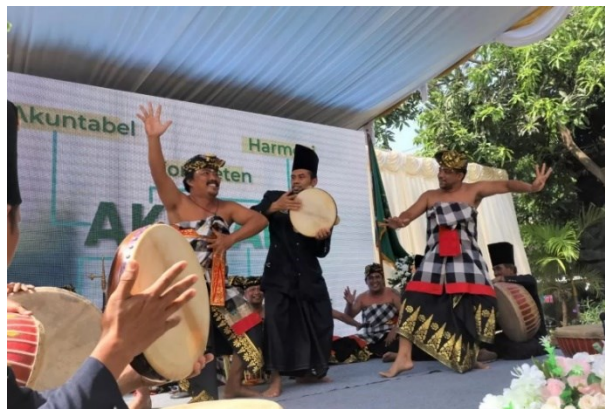
Figure 3. Burcek and Cekepong Arts Performances

The figure below is a collaborative burcek art between Hindu and Muslim communities which occurred in Budakeling Village. Apart from being performed in government activities, this artistic collaboration is performed during the cremation ceremony. This performing art is full of tolerance value since there is a collaboration between two different arts which become one on stage and when the funeral/cremation ceremony takes place, the art of burdah is invited to perform. The ceremony is not complete without the budrah performance.