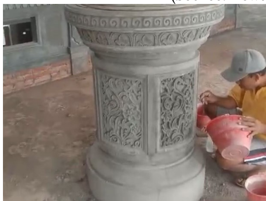
Figure 6. Process of Making the Pillars of the Jami' Nurul Hayat Mosque Adopting Balinese Ornaments