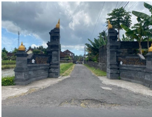
Figure 4. Gate of Kampung Saren Jawa

The values of tolerance are built through the adoption of building art; especially, Balinese ornaments. They do not only have an aesthetic meaning, but they also have aims and objectives that are to respect Balinese art and culture by making it actual through the construction of facilities; such as, mosques, bale banjar, and gates. In addition, direct respect through building art increasingly shows the value of tolerance between Hindu and Islamic communities.