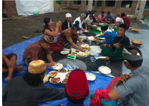
Figure 1. Megibung Hindu and Islamic Communities in Kampung Saren Jawa Source: Komang Januryanto, April 16 th 2023

inviting the Hindu community to megibung, the food that we prepare certainly does not contain beef as the basic ingredient, because according to Hindu beliefs, cows are considered sacred.”