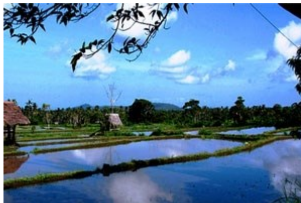
Figure 2. Subak in Budakeling Village

The figure below shows the rice fields condition in Budakeling Village. It is widely along this village road. As explained above, land ownership is not only owned by Hindu communities, but it also owned by Muslims. Therefore, they also join the Subak organization. Meanwhile, seen from a sociological perspective, Subak contains the values of togetherness; especially, togetherness that is gathered in one organization which has members with different religious backgrounds. Subak activities involve the togetherness of members regardless of their religious status; such as, conducting irrigation repair activities, donations for public facilities related to Subak, meetings, and so on.