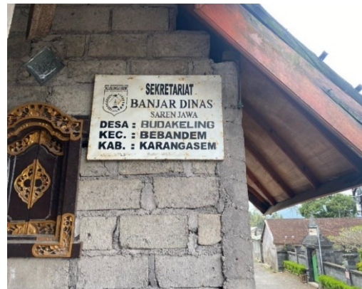
Figure 5. Bale Banjar